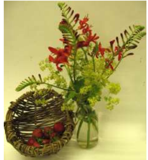
Still life with willow basket