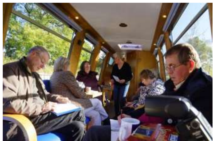
Autumn day – writing aboard 'The Beatrice'