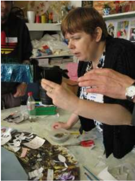
Learning the skill of film animation

1. We used Big Lottery funding from HealthFair/People's Health Trust (PHT), Churnet Valley Living Landscapes Project and Awards for All (A4A) to support our weekly creative writing and expressive arts sessions. A4A writing outreach has just started for Rethink with sessions in Ipstones planned for later in the spring. With PHT permission we continued to deliver arts workshops to people in recovery from addiction at The Hub in Leek, but sadly this facility has now closed.