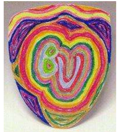
Mask, inspired by Hundertwasser