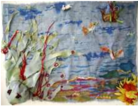
Tie-dye underwater scene

Borderland Voices belongs to Support Staffordshire (Staffordshire Moorlands) which helps with recruiting/training volunteers, offers advice on policies, procedures and funding and facilitates links with other community and voluntary organisations. We regularly update our health & safety policies and provide individual risk assessments as appropriate for external activities and workshops.