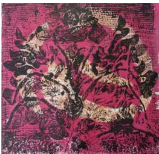
One of our many collagraph prints exhibited in Stoke on Trent