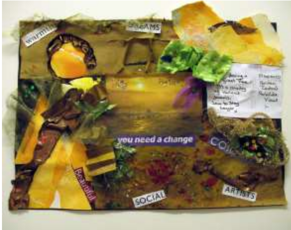
Collage – ‘holiday greetings’

Our finances remain strong, enabling us to fund our core activities for about 2 years hence.