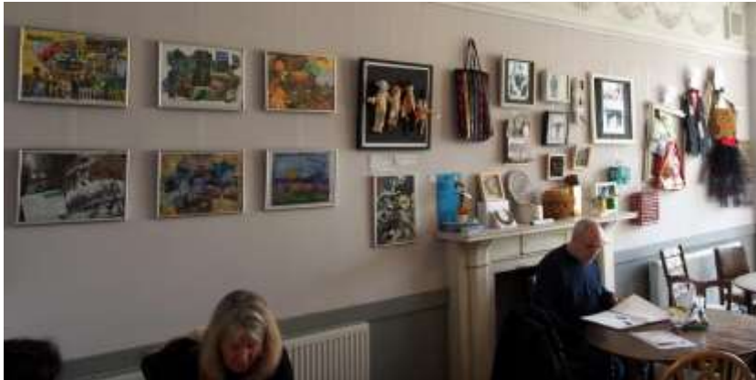
Borderland Voices work in a Recycled Art exhibition at the Foxlowe