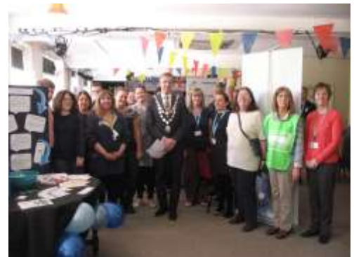
Mental Health Awareness Day, Foxlowe