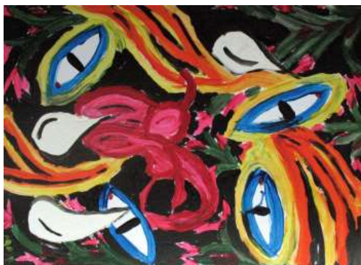
'Tyger, Tyger, burning bright'

For a number of years we have been unable to secure funding for the large projects we used to. It seems the money just is not available. While the funding we have received is less than those heady days it enables us to fund the Writing and Arts Groups but other activities are more modest. Personally I am happy with this change.