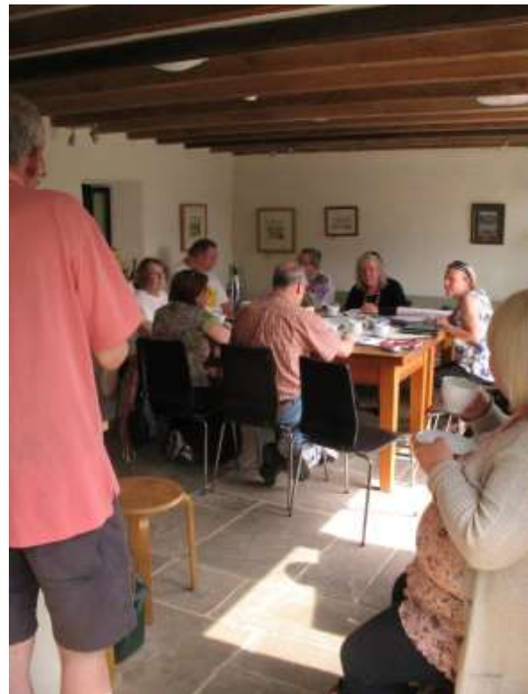
Writers at the Dove Valley Centre

3. Visits (Rudyard Lake; the Green Man Gallery in Buxton; the Dove Valley Centre; aboard the 'Beatrice' canal boat; working with the Staffs Poet Laureate in Leek Library; for the annual BBQ; Christmas lunches; sewing /patchwork centres) not only provide inspiration but also an extended opportunity for the socialisation which is an essential part of our activities. All weekly sessions (patchwork, creative writing and expressive arts) are full, attracting on average 10 people. They are alive not only with creativity but also conversation and laughter, as people enjoy both the varied art forms and one another's company. With the support of their peers, 3 or 4 participants take it in turns to facilitate writing once a month. Being a Healthwatch champion organisation allowed us to enable participant feedback to Healthwatch about changes they personally had experienced in health and social services locally.