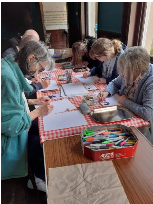
Art session in the bar area of the Foxlowe

Though we've had fewer visits than last year (during the WLA project) we went with OUTSIDE's WayMaking to Gradbach. It