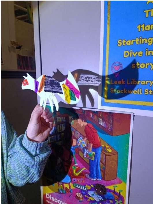
Community library session created shadow puppets for '24 Doors'

ever, remaining a vital awareness-raising tool. We also sent copies to the King and to the Princess of Wales, both of whom acknowledged it warmly.