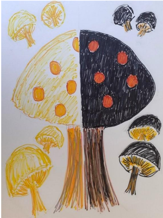
Equinox - Mavis