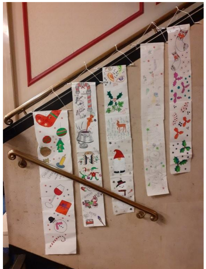
Wall hangings, including some of the 5 ways to wellbeing decorating the stairwell of our door, '24 Doors' living advent evening