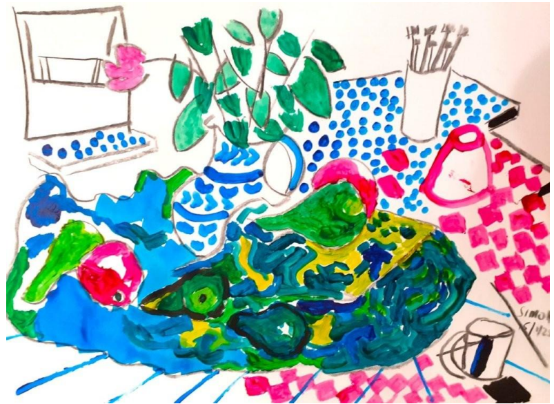
Acrylic flowers and still life - Simon

The date just happened to coincide with the 80 th anniversary of the Battle of Monte Cassino, where the Polish 2 nd army was pivotal. Many veterans eventually came to Blackshaw Moor resettlement camp just outside Leek (one of many such camps throughout Britain) and established our local Polish community. A decision to have some joint elements of celebration (in addition to a separate and immensely popular Polish exhibition in the Nicholson) meant that our 40s Day included Polish cut paper craft, some Polish food and the splendid Manchester Polish Dance Troupe during the interval in the evening ‘Swing Band’ dance.