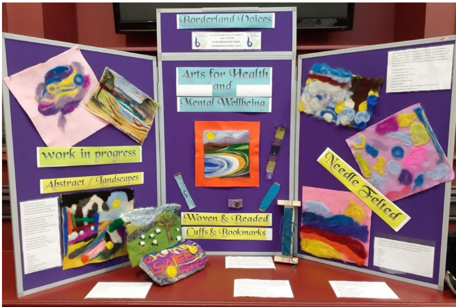
Textile display in the Nicholson Institute: felted landscapes, woven/beaded cuffs and bracelets and creative writing

And we have contributed to a number of local face-to-face events.