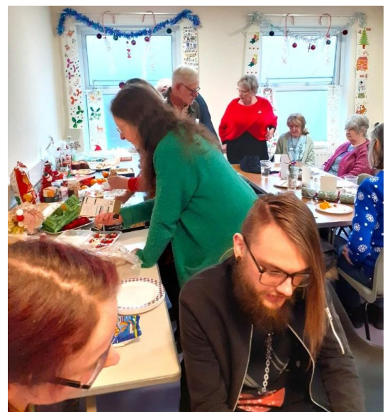
Christmas bring and share lunch, which included trustees