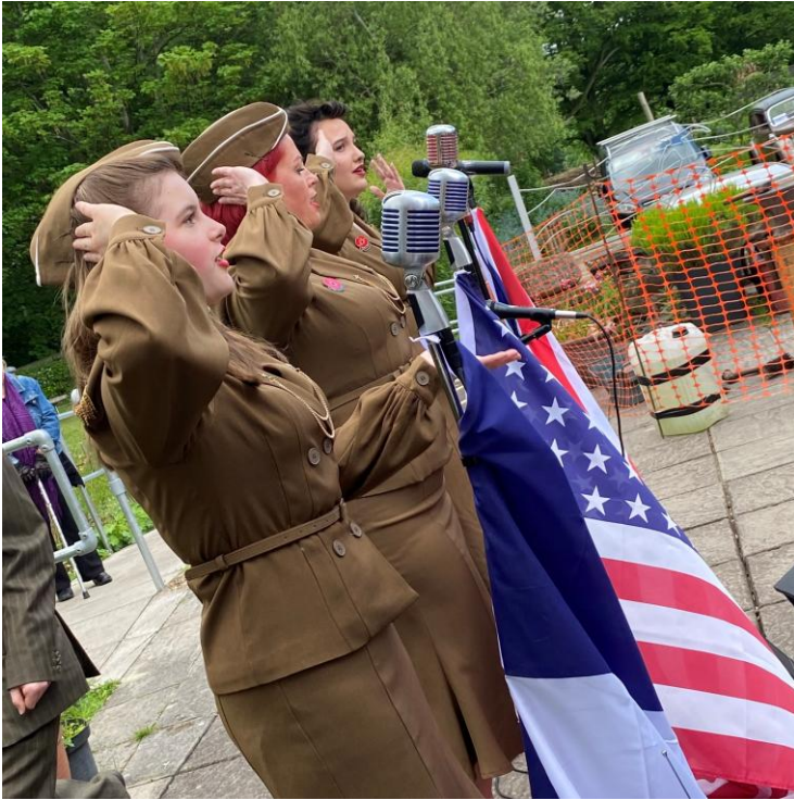
The Rockabilly Dolls provided wonderful close-harmony singing of 40s favourites throughout the 40s Celebration, interspersed with a George Formby tribute act.

Reaching N Staffs (RNS) who meet there weekly. Unfortunately few RNS members got involved, and several from BV found the area very cold (we were there November to March) so it was disappointing.