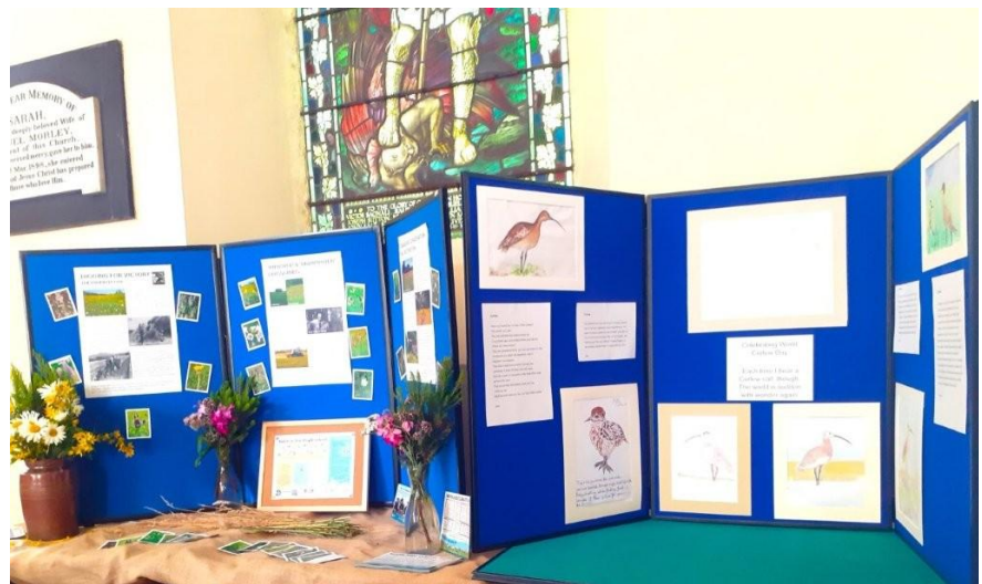
Curlew display in Warslow Church for their Flower Festival

Andy took the WLA exhibition and kids activities to a D-Day commemoration event in Endon in June 2024, involving 2 local primary schools and Sarah followed this up with similar activities at Endon Breakfast Club in August 2024.