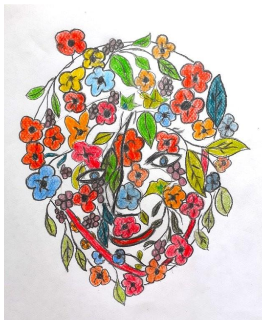
Castleton Garland Day - Pauline

Art sessions have included Curlews (Moira McCourt), Castleton Garland Day (Sarah), colour and texture (Andy), coastal towns (Andy), flowers in watercolour and pen (Sheena), textiles including needle-felted landscapes and beaded bracelets (Kim Greenwood), 5 ways pocketbooks (Sarah), the autumn equinox, autumn landscapes and Halloween (Andy), Connect (wall-hangings for 24 Doors evening, Sarah), capturing 'Activity' (Sarah), Notice (observational drawing, Sarah), Give (posters, Sarah), Christmas – love it or loathe it? (shadow puppets, Gordon McLellan), Christmas decorations (Andy), flowers in acrylics (Frances Naggs), Imbolc and the Snow or Bony Moon (Sarah) and