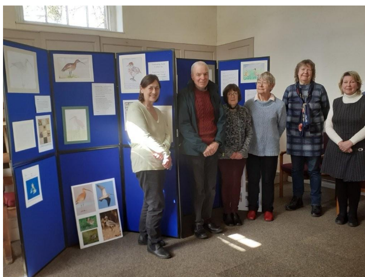
Curlew display at Leek Quaker Meeting House