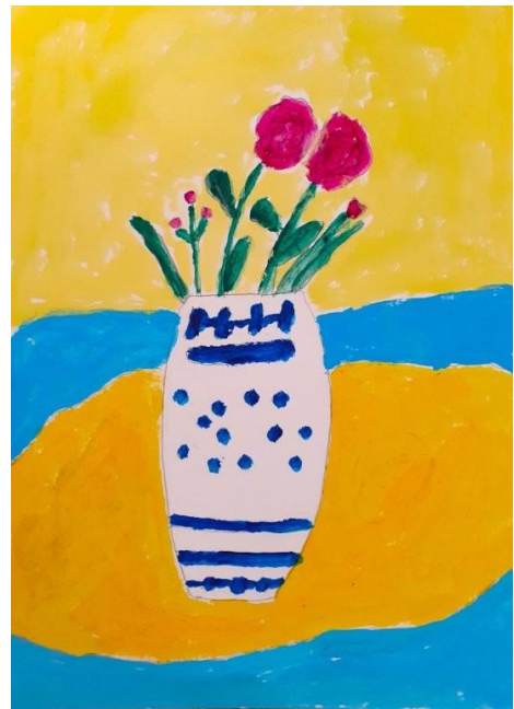
Acrylic flowers - Rachel

is an active virtual space where members and 'friends' share news and views.