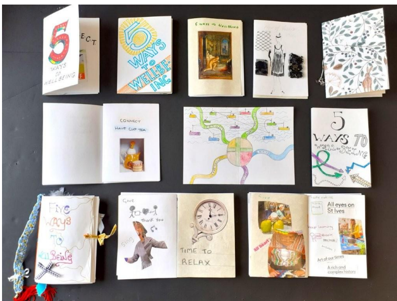
5 ways to wellbeing – stitched, illustrated booklets

Massive congratulations Andy to you and all the team on such a wonderful, joyful and inspiring