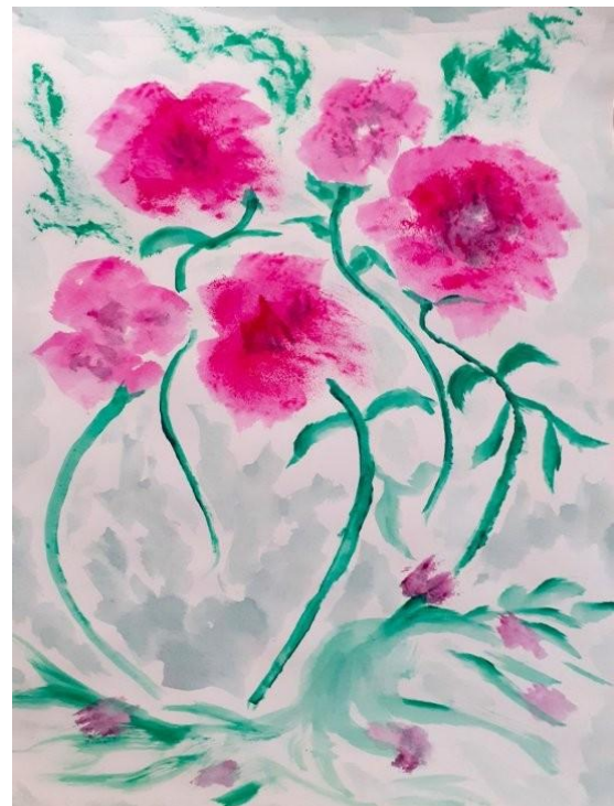
Acrylic flower study - Tia

The section on Impact/Value includes feedback from participants at the end of the WLA project (which contributed to our successful final report to NLHF) plus selected evaluations from lead artists during the SCC project (which will likewise feed into its final report).