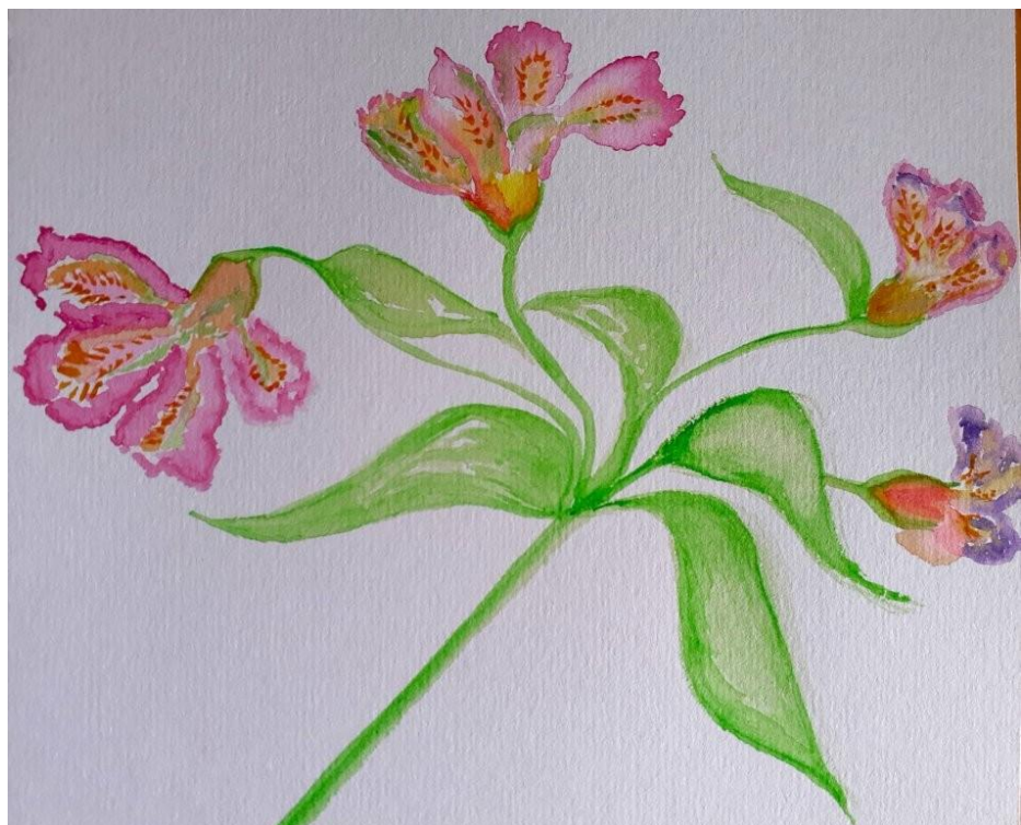
Watercolour flower study - Tia