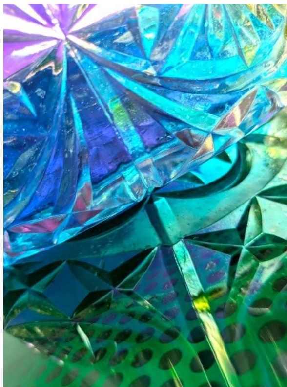
Photograph - Jeanette

Lead artist's evaluations, SCC/VCSE grant project