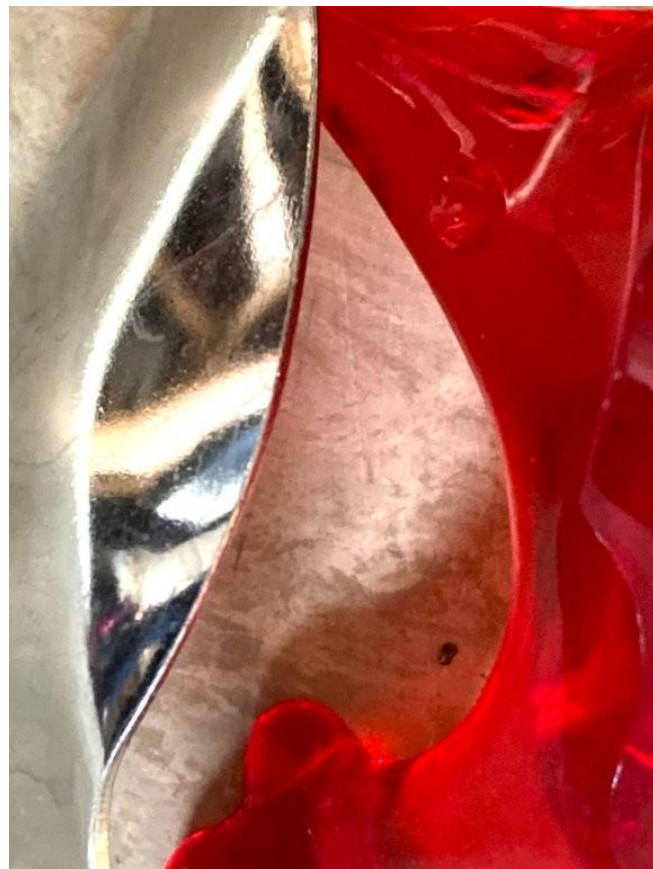
Photograph - Simon

All engaged well with the Five ways theme, learning and creatively interpreting each of the ways. This was maintained at intervals throughout the nine months the project ran.