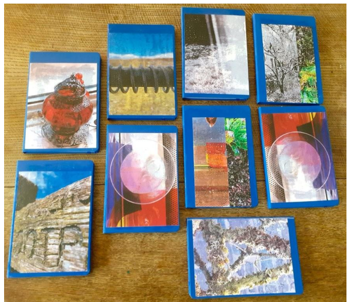
Photos transferred onto notebooks